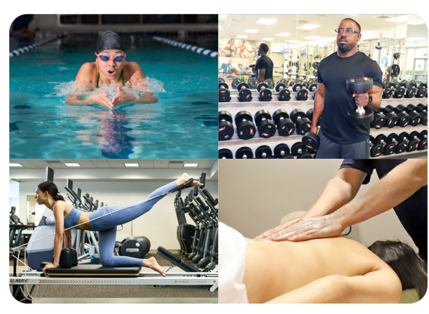
24525 Town Center Drive, Valencia, CA, 91355